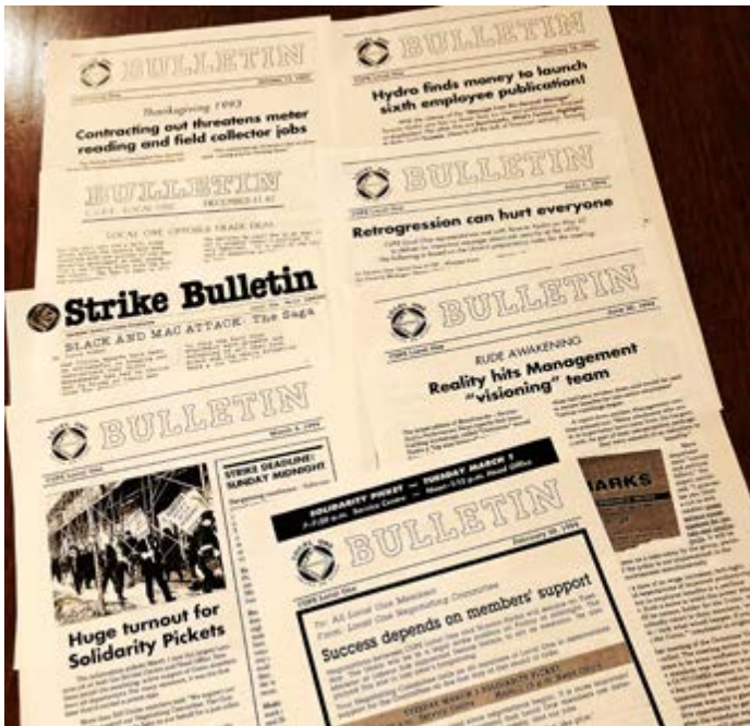
Local One's agitational newsletter challenged employer propaganda and 'fanned the flames.'