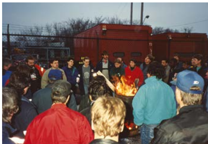
Serious meeting at dusk in the 1989 strike – Local One flying squads

In 1999 Local One played an important role in defeating Mike Harris’s draconian Bill 136, a huge threat to Local One. At the time, we faced the task of harmonizing collective agreements from six former utilities that had been amalgamated into a new Toronto Hydro. Bill 136 sought to throw out existing collective agreements of unions in our situation and force us into first contract arbitration, essentially starting over. Local One waged a successful three-week strike that was an important contribution to the province-wide campaign that defeated Harris’s scheme.