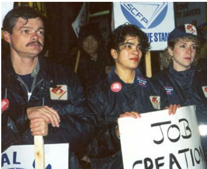
Early morning picket at Hydro's Head Office by meter readers in the Salaried Unit in 1994. Although guaranteed continued employment, they fought contracting out of their jobs. "Say yes to steady jobs!" "Cutbacks in services hurt us all!" "Job creation NOT job elimination!" "Every job matters"