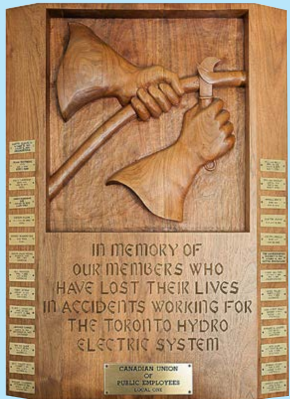
Local One memorial plaque honouring members killed on the job.

On far too many occasions, grim gatherings at the plaque added another name. Those tragedies sent out waves of trauma and suffering affecting many people.