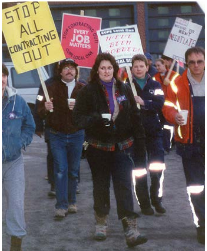
Simultaneous picket at Hydro depot by Hourly Unit members in solidarity with meter readers. At noon, Hourly Unit trucks rumbled by Head Office (a popular 'drive-by' tactic) with a message for Hydro Commissioners arriving for a meeting.