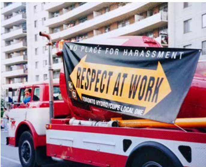
Local One wins the right to refuse harassment in 1992, almost 20 years before it became the law in Ontario.